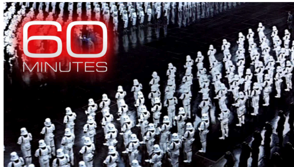
60 Minutes Praises The Galactic Empire's Gun Control Policies

Appeals Court Strikes Down Federal Gun Ban for Non-Violent Felon Motions Filed in Fight Against Pennsylvania's Carry Age Restriction Fight Biden's Legacy on Gun Control Fleeting at Best